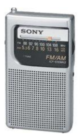
Figure 1. Sony ICF-S10MK2 Radio